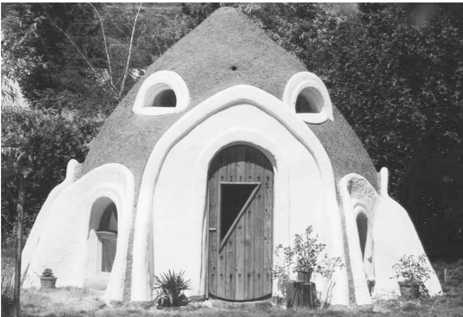
1.1: Using earthbags, a whole house, from foundation to walls to the roof, can be built using one construction medium.

heritage. Monolithic earthen architecture is common in his native home of Iran and throughout the Middle East, Africa, Asia, Europe, and the Mediterranean. Thousands of years ago, people discovered and utilized the principles of arch and dome construction. By applying this ancient structural technology, combined with a few modern day materials, Nader has cultivated a dynamic contemporary form of earthen architecture that we simply call Earthbag Building.