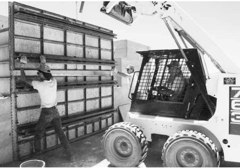
1.5: The entire form box can be set in place using the Bobcat. Steel whalers keep forms true and plumb and resist ramming pressure.