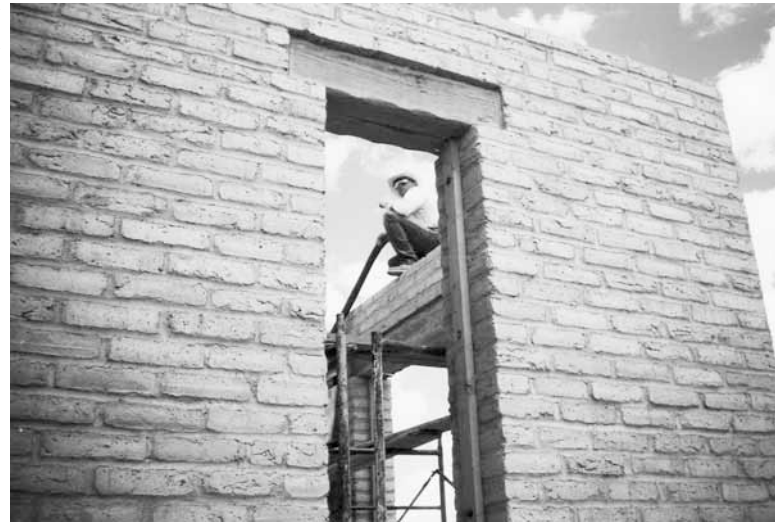
1.3: A freshly laid adobe wall near Sonoita, Arizona.

They cannot be used for wall building until they have completely cured. While this is probably the least expensive form of earthen building, it takes much more time and effort until the adobes can be effectively used. Adobe is the choice for dirt-cheap construction. Anyone can do it and the adobes themselves don't necessarily need to be made in a form. They can be hand-patted into the desired shape and left to dry until ready to be mortared into place.