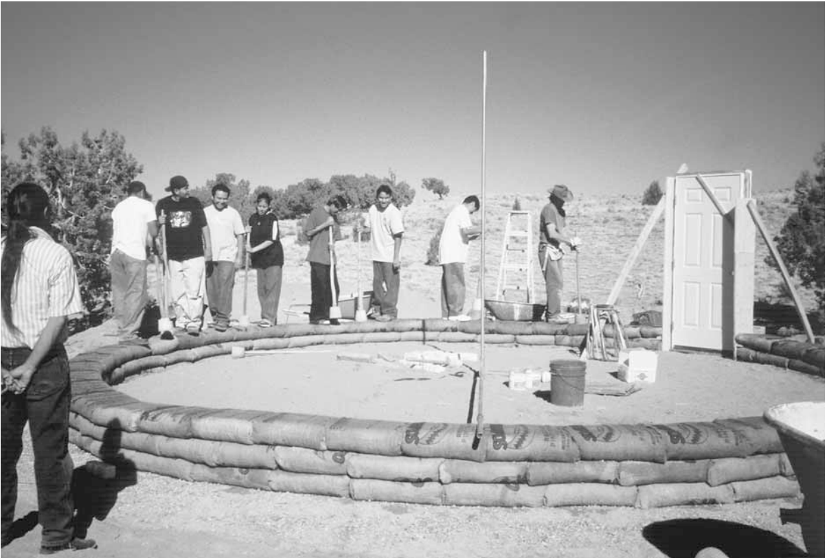
1.10: Students working on Community Hogan on the Navajo Indian Reservation.

currently house over one-third of the world's population, in climates as diverse as Asia, Europe, Africa, and the US with a strong resurgence in Australia. An earthen structure offers a level of comfort expressed by a long history of worldwide experience. Properly designed earthbag architecture encourages buried architecture, as it is sturdy, rot resistant, and resource convenient. Bermed and buried structures provide assisted protection from the elements. Berming this structure in a dry Arizona desert will keep it cool in the summer, while nestling it into a south-facing hillside with additional insulation will help keep it warm in a Vermont winter. The earth itself is nature's most reliable temperature regulator.