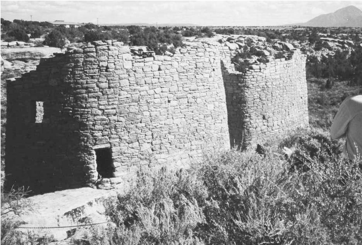
1.11: Typical 1,000-year-old Anasazi structure, Hovenweep National Monument.

embodied energy product. What one saves on materials supports people rather than corporations. The simplicity of the technique lends itself to owner/builder and sweat-equity housing endeavors and disaster relief efforts. Properly designed corbelled earthbag domes excel in structural resilience in the face of the most challenging of natural disasters. Does it really make sense to replace a tornado-ravaged tract house in Kansas with another tract house? An earthbag dome provides more security than most homeowner insurance policies could offer by building a house that is resistant to fire, rot, termites, earthquakes, hurricanes, and flood conditions.