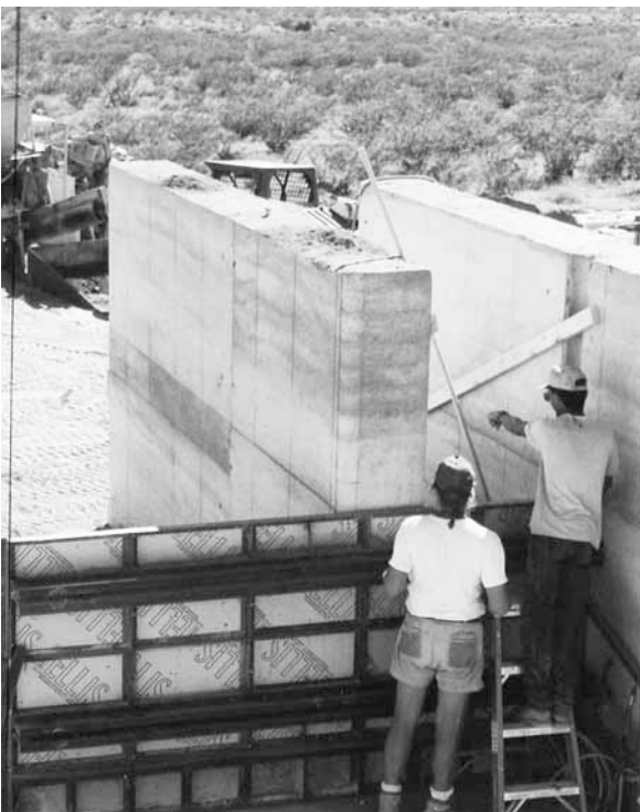
1.6: Rammed earth wall after removal of forms.