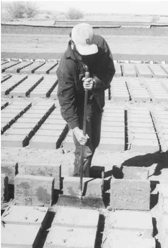
1.4: Cleaning adobes at Rio Abajo Adobe Yard, Belen, New Mexico.

Adobe is made using a clay-rich mixture with enough sand within the mix to provide compressive strength and reduce cracking. The mix is liquid enough to be poured into forms where it is left briefly until firm enough to be removed from the forms to dry in the sun. The weather must be dry for a long enough time to accomplish this. The adobes also must be turned frequently to aid their drying (Fig. 1.4).