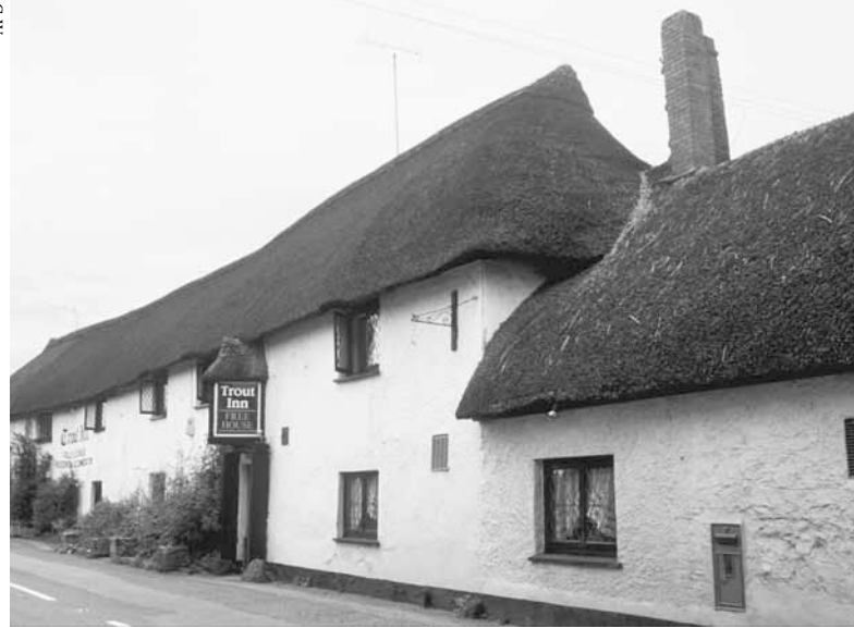
1.7: Example of historic cob structure; The Trout Inn in the U.K.