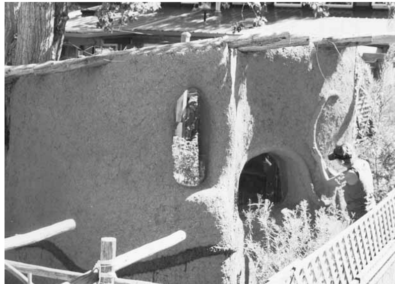
1.8: Michelle Wiley sculpting a cob shed in her backyard in Moab, Utah.

of each lift and the prevailing weather conditions. Earthbag building doesn’t require any of this extra attention due to the nature of the bags themselves. They offer tensile strength sufficient to prevent deformation even if the soil mix in the bag has greater than